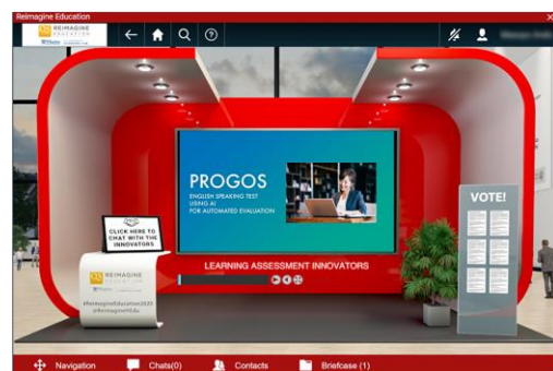
The Online 'Reimagine Education Conference'; Entrance Hall (left) and Exhibition Booth of PROGOS (right)

This award is attended by educators and investors from the world, and the winners are given opportunities for further business growth. Moreover, for the winners of this world-rank award, their projects are proven to have innovative values by global standards.